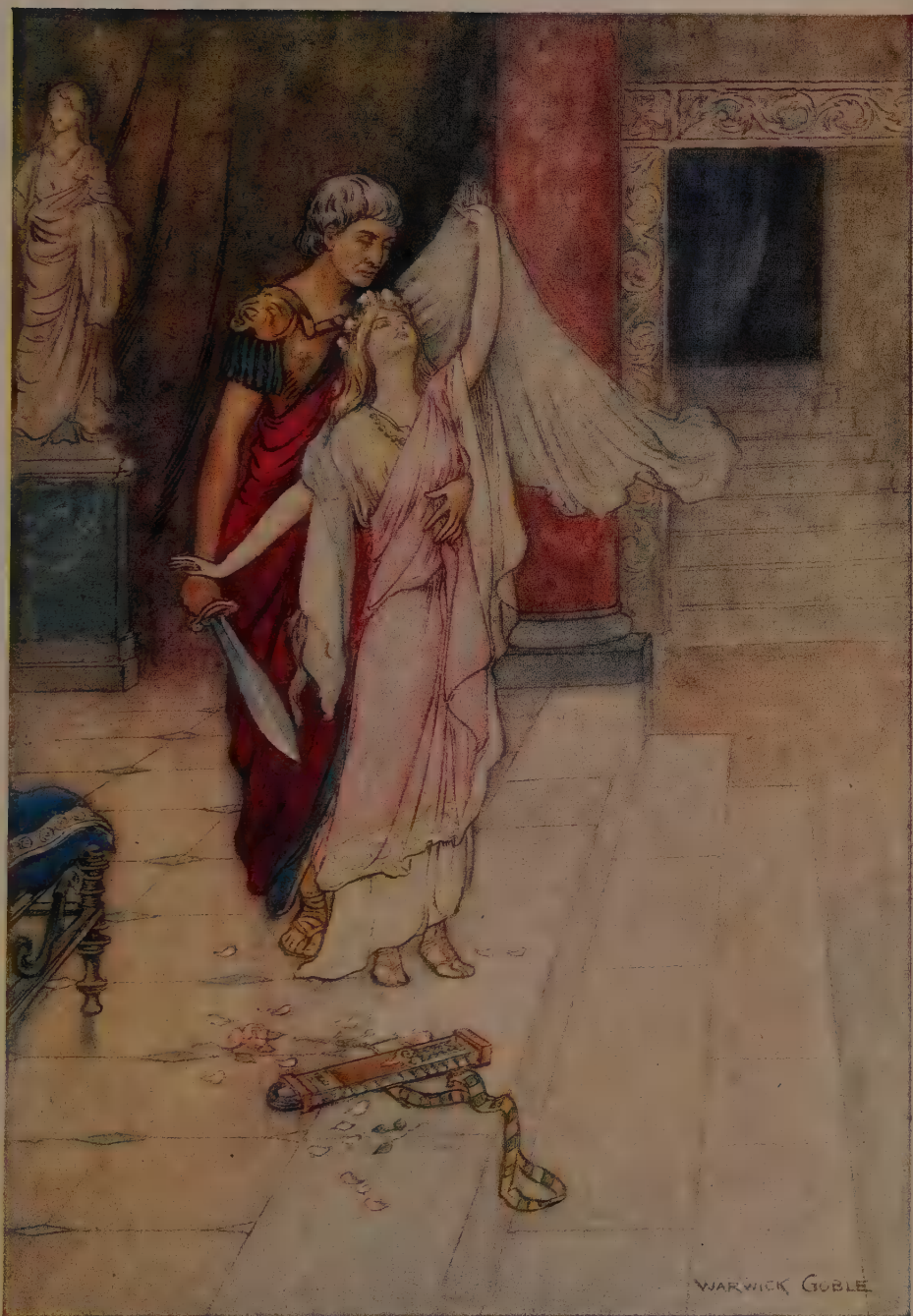
VIRGINIUS AND VIRGINIA